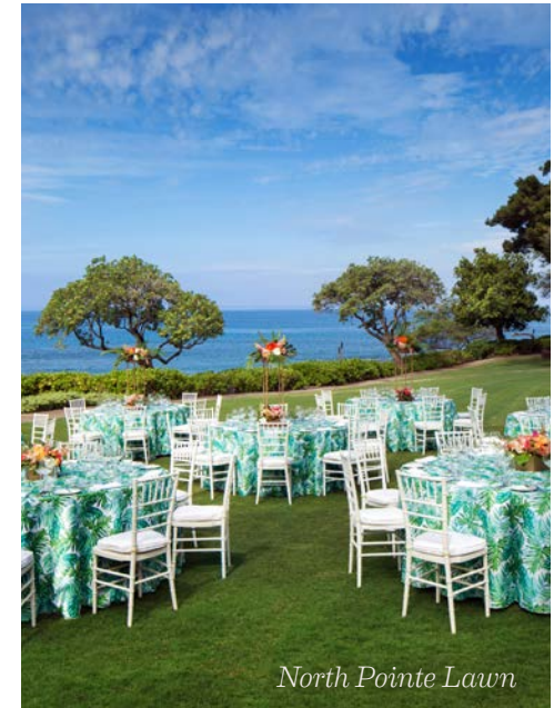
North Pointe Lawn